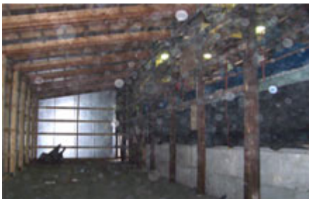
Interior of the completed new extension