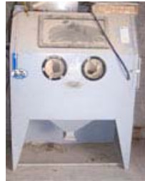
← 'SKAT BLASTER'